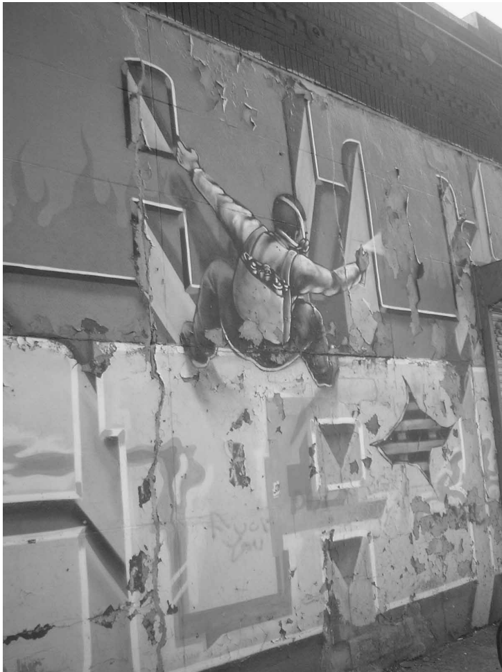
Figure 1 Tats Cru graffiti seen on the Bronx Soundwalk.

Street is my home. You might even see me walking by and not recognise me, but I still live here. I grew up here, this is my neighbourhood. I am going to take you on a tour. Enjoy. Now start walking towards the head of the station and remember to take the second turnstile. Remember, follow me, take your time, relax. Move with me. We are going hit the whole neighbourhood; we are going to see the best artists in the world. Tats Crew (music) ("Bronx Soundwalk: Graffiti" 2003)